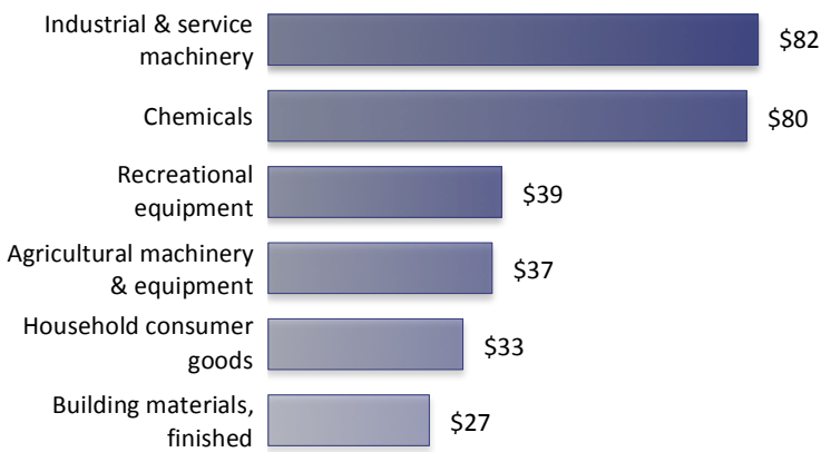
South Carolina's GSP Imports by Product Type, 2016 ($ millions)